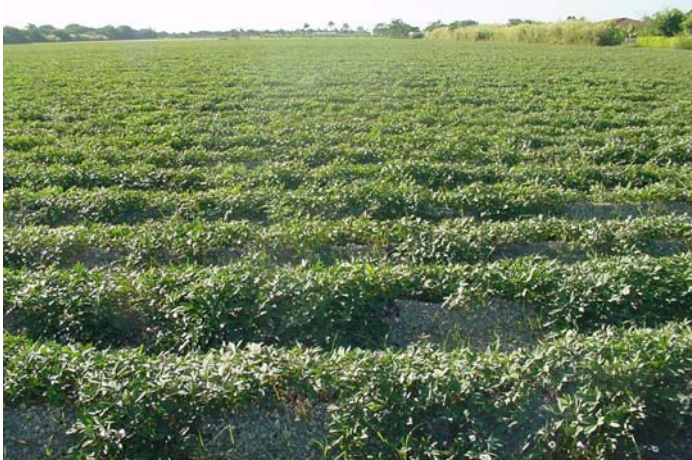
A field of boniato in Homestead, Florida

Boniato: Is also commonly called Cuban sweet potato. In many of the Central American countries, it is called “camote.” Currently, Miami-Dade County is the largest producer of boniato in Florida. In south Florida boniato is planted year-round. The average growing season is 150 days. In Miami-Dade County, close to 5000 acres of boniato is cultivated annually. There are two commercial varieties of boniato in production in South Florida. They are ‘Picadia’, usually grown in the fall and winter and ‘Campeon” which is grown in the summer and fall. Boniato is not as high yielding as regular sweet potato varieties. In Miami-Dade County, the average yield is 5-6 tons/acre. More information about the production of boniato is available at the website http://edis.ifas.ufl.edu/MV030 and http://edis.ifas.ufl.edu/pdf/files/CV/CV28600.pdf .