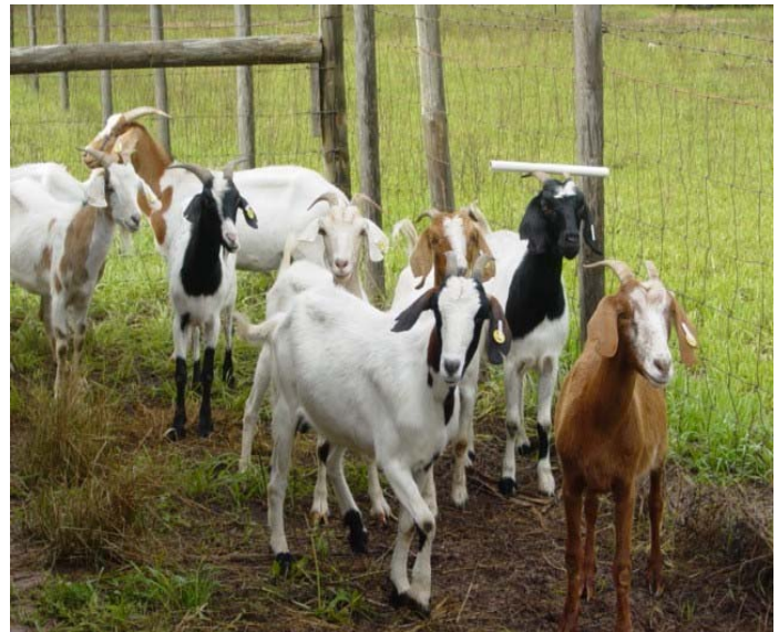
A healthy herd